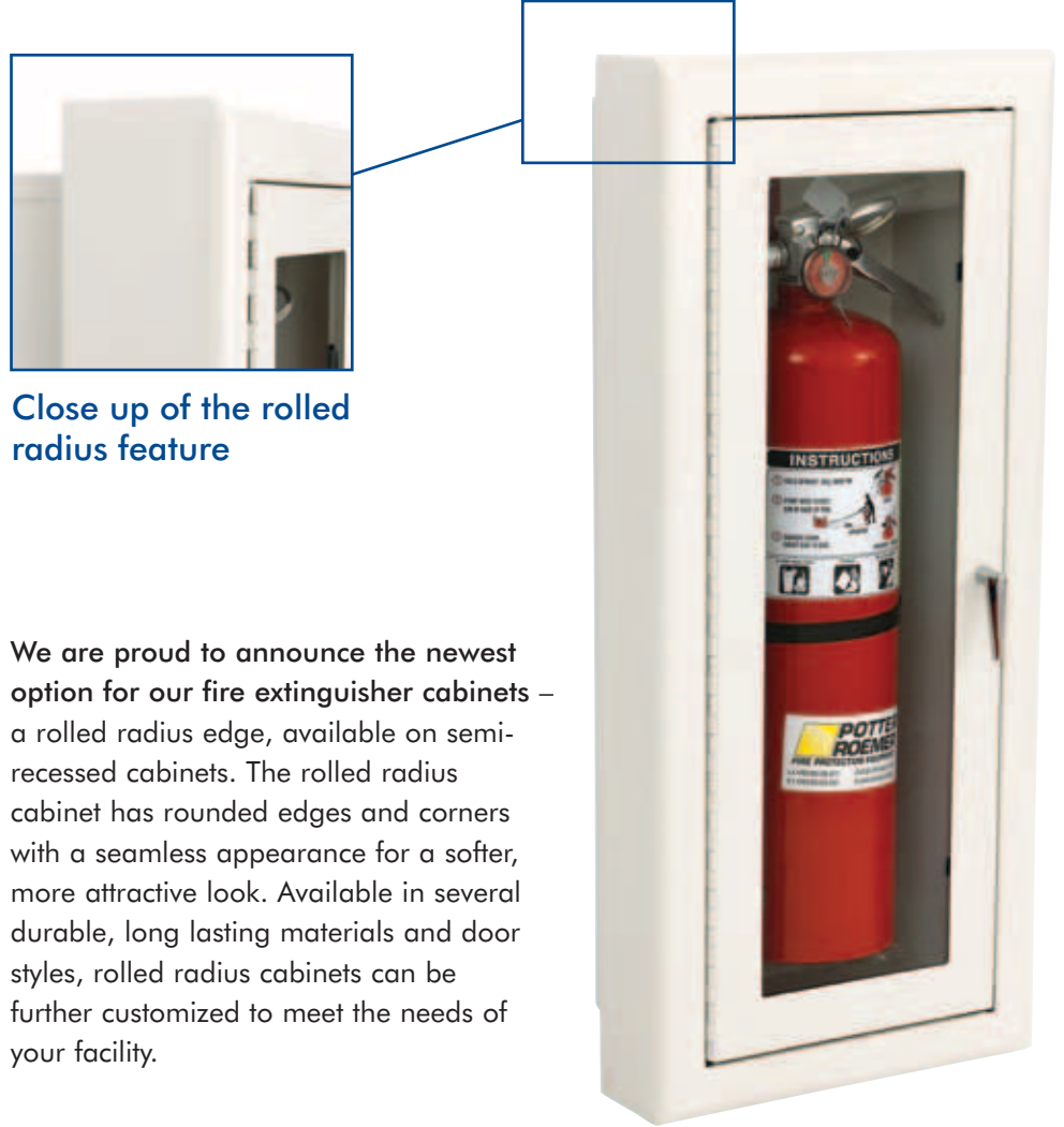
Close up of the rolled radius feature

Potter Roemer has been offering quality fire protection equipment for 75 years. Since 1937, we have been continually improving our products in order to offer you a product that is fully customizable.