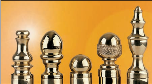
STEEPLE CROWN BALL ACORN URN

Designed for installation on doors of medium weight with average frequency of usage, these solid brass hinges are suitable in light commercial and residential applications. The 985BB features two permanently lubricated, non-detachable, hardened chrome alloy ball bearings that increase load capacity and hinge life. They may be used on wood or hollow metal doors and corresponding frames. The stainless steel, rust-proof pin is knurled at the top to prevent rising, yet is "free-floating" within the barrel of the hinge. The pin can be easily removed by unthreading each finial and tapping the pin upward. They conform to ANSI (American National Standards Institute) A2112 Specifications for performance, screw hole and cutout locations.