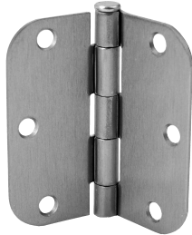
RPB73535-58 (Shown) RPB73535-14