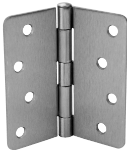
RPB74040-58 RPB74040-14 (Shown)