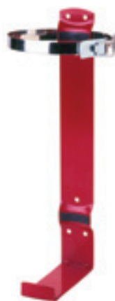
Pt. # 700430