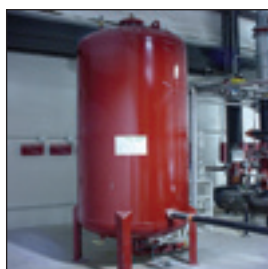
Foam Bladder Tanks