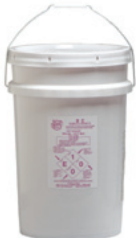
Purple K Pt. # 61200