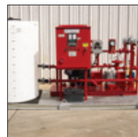
Diesel Pump Skids