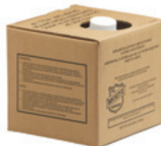
6 Liter Container Pt. # 600872