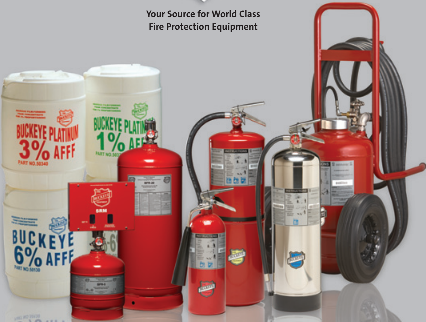
Foam Concentrates & Hardware

Your Source for World Class Fire Protection Equipment