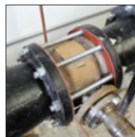
Foam Concentrate Proportioners