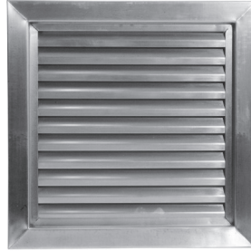
800A1 in Optional Stainless Steel Finish

Inverted "Y" Blades Recommended for Schools, Class "A" and Institutional Buildings.